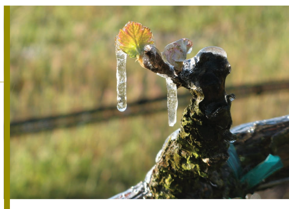
Before temperatures dip below freezing during the winter months, Frostwatch Winery co-owner Brett Raven bundles up and heads outside to activate a frost-control system for the vines. Depending on the conditions, he will use either cold air drains or overhead microjet sprinklers that put just enough water on the vines to prevent damage. Pictured above are fruiting spurs encased in protective icicles hanging from the trellis wires.

the palate, spiced melons and lemons develop floral characteristics. At mid-palate, the viscosity spreads to a creamy array of peach tart with a hint of salinity on the bright finish. 94